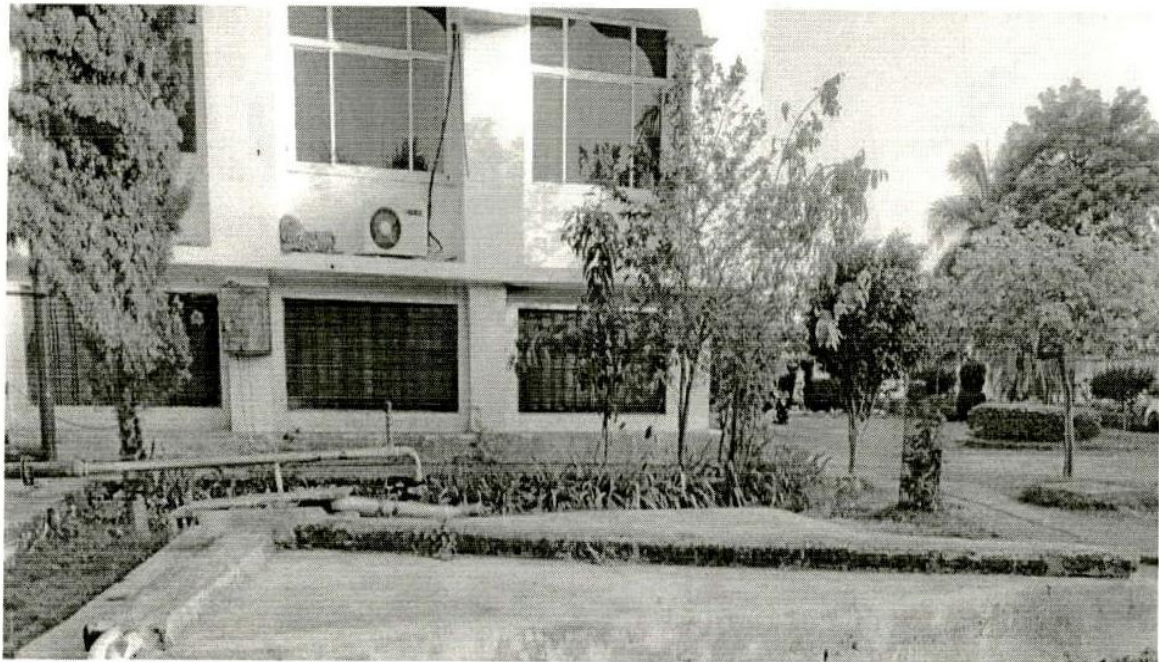
Water Harvesting (Closed Tank)